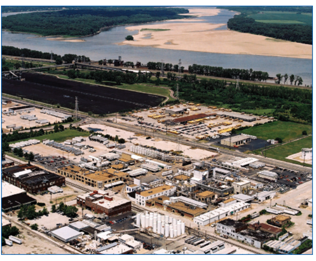
ELANTAS PDG, Inc. headquarters in St. Louis, Missouri

ELANTAS Electrical Insulation companies are strategically located throughout the world to meet the primary insulation, secondary insulation and electronic and engineering materials needs of our customers.