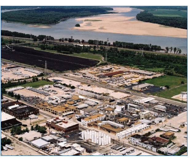
ELANTAS PDG, Inc. headquarters in St. Louis, Missouri

ELANTAS Electrical Insulation companies are strategically located throughout the world to meet the primary insulation, secondary insulation and electronic and engineering materials needs of our customers.