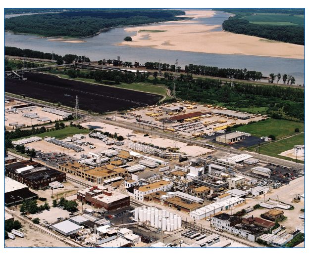
ELANTAS PDG, Inc. headquarters in St. Louis, Missouri

ELANTAS Electrical Insulation companies are strategically located throughout the world to meet the primary insulation, secondary insulation and electronic and engineering materials needs of our customers.