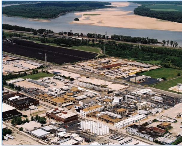
ELANTAS PDG, Inc. headquarters in St. Louis, Missouri

ELANTAS Electrical Insulation companies are strategically located throughout the world to meet the primary insulation, secondary insulation and electronic and engineering materials needs of our customers.